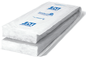
Comes in batts

*Truckload contains loose bundles only, no pallets. Lift gates are not available on delivery trucks.