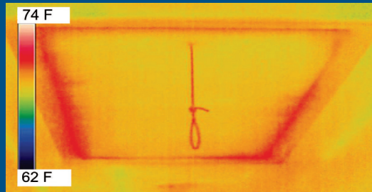
With the TAP® Hatchmaster Installed to Save Energy All Year Long.

The ASTM C236-1224 tests that determine a product's r-value yield the following results for Double Bubble Reflective Insulation: Down=R-15.2, Up=R-6.8, Horizontal=R-8.5.